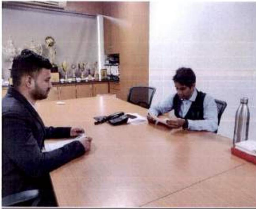
Figure 21 - A final year student appearing for interview with Shreyash Associates