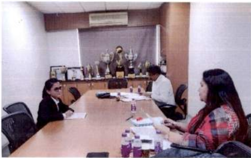
Figure 16- A final year student appearing for the Mock Interview