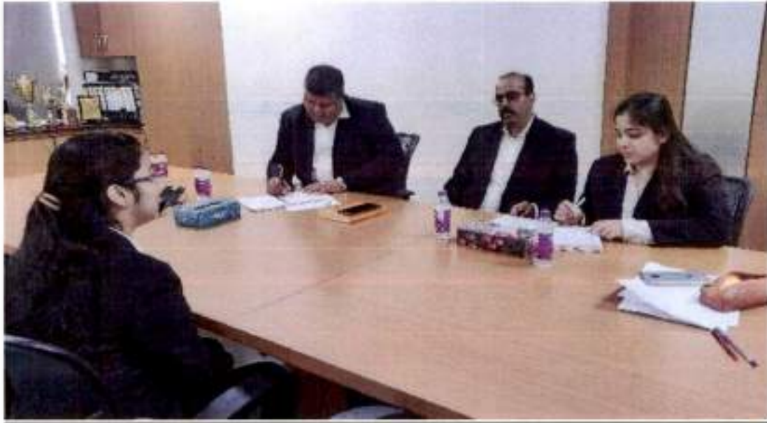
Figure 23- A final year student appearing for interview with AV Legal