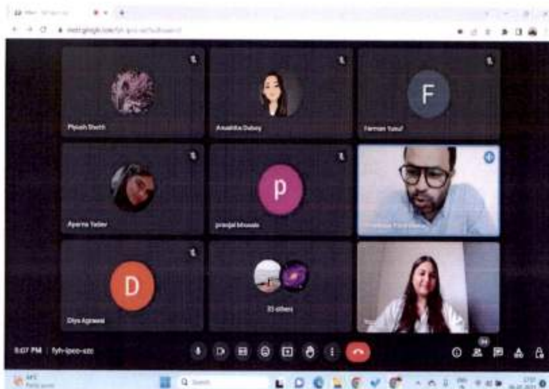
Figure 15- The Online Session in progress, Mr. Shreedhar Parundekar addressing the students