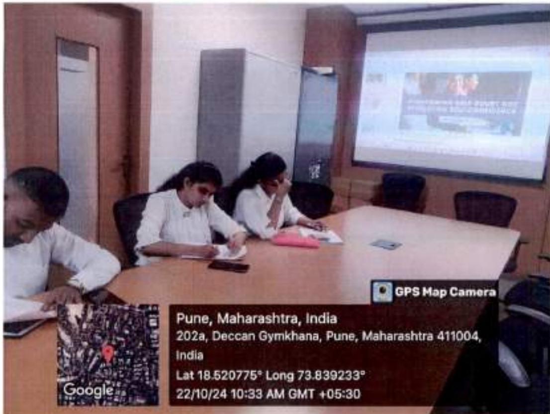
Picture 34: Students doing a self assessment on Rosenberg Self Esteem Scale (RSES)