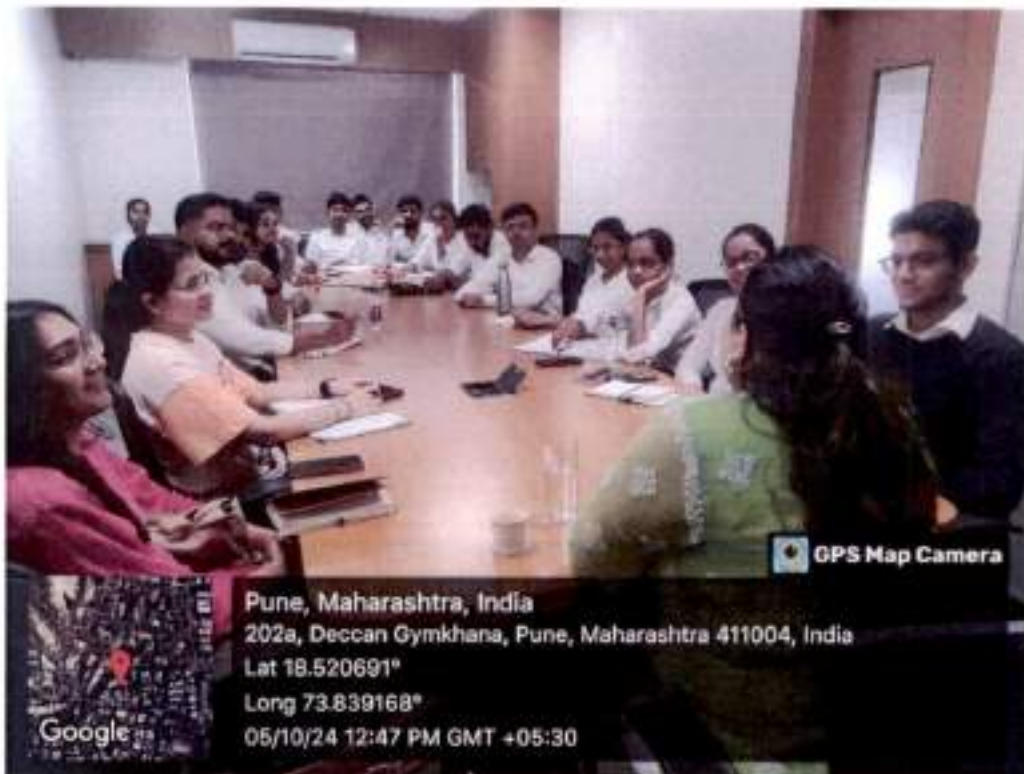
Picture 26: Final year Students attending the exclusive session crafted for them