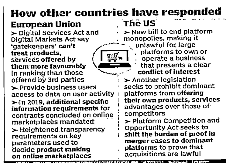
Figure 2. Countries responded

The electronic payment transfer is governed by multiple regulations in the U.S. Use of electronic payment systems for the purchase of goods or services is not restricted by statute. It is the provision of electronic payments services that is subject to a number of regulations. These include Regulation E under the Electronic Fund Transfer Act (15 USC 1693 et seq) that regulates electronic funds transfers and imposes substantial disclosure requirements on providers of electronic funds transfers. It applies to any electronic fund transfer that authorizes a financial institution to debit or credit a consumer's account, including ATMs, direct deposit, gift cards, online banking, point of sale transfers, debit cards, electronic check conversion and telephone transfers. Regulation E, issued and administered by the Consumer Financial Protection Bureau, applies a number of protective measures to consumers, including access to data and rights to dispute transactions. Article 4A of the Uniform Commercial Code covers wholesale wire transfers that are expressly outside of the scope of the Electronic Fund Transfer Act . Apart from these broad provisions, the FTC regulates the consumer advertising regulations. There are plethora of rules and regulations dealing with defamation, shutdown and takedown, etc. Apart from these analytical explorations of the U.S. regulatory system, the following diagram depicts how other foreign jurisdictions have responded to e commerce revolutions.