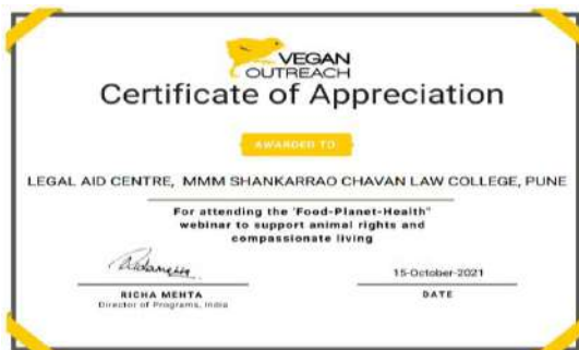
Centre Received Appreciation from Vegan Outreach

Efforts, Work and Dedication of Legal Aid Centre, its Volunteers and Co-Ordinator's has been appreciated by different Governmental and Non-governmental agencies.