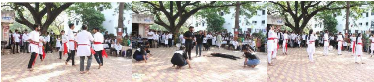
Glimpses of performance by participants