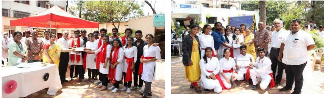
Felicitation of Winning Team