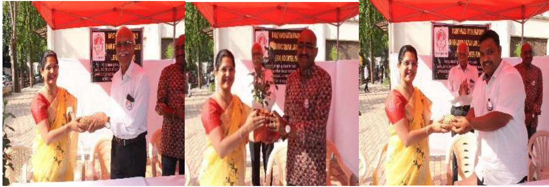
Felicitation of Judges by the Principal Madam