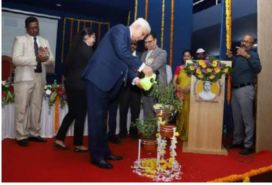
Watering of plant