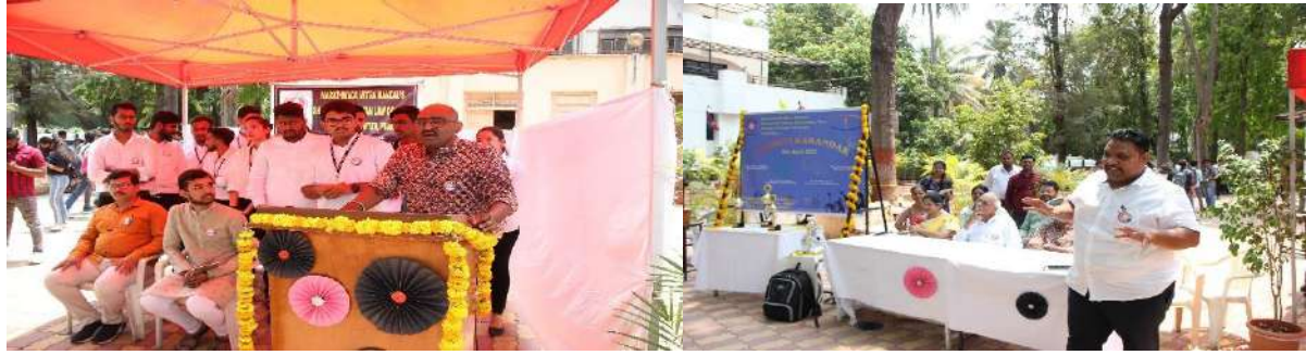
Judges Addressing the Participants