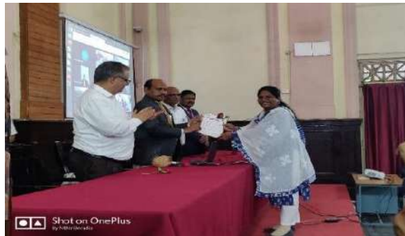
Appreciation of Co-Ordinator's of Legal Aid Cent