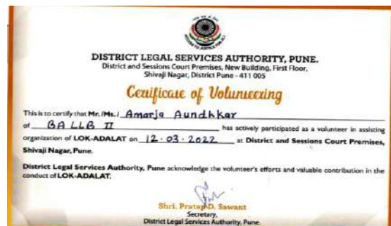
Appreciation of Volunteers for assisting National Lok Adalat