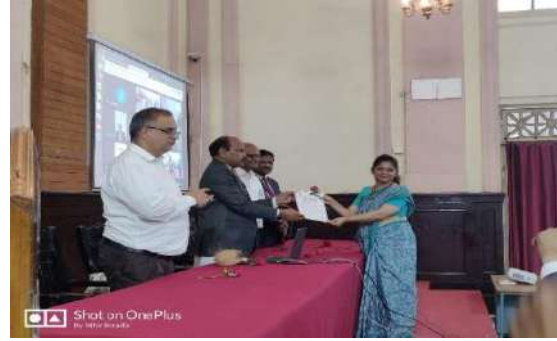
Appreciation of Principal SCLC