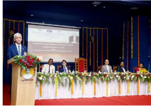
Addressing the students