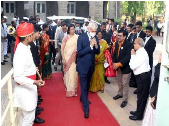
Welcome of Guest