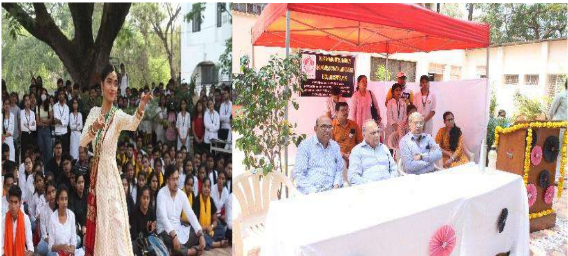
Performance by Volunteer