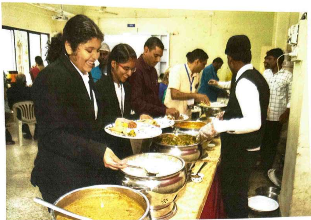
PARTICIPANTS- ENJOYING FOOD