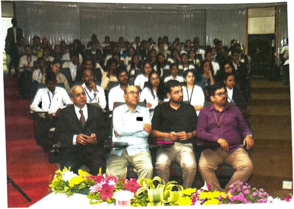
PARTICIPANTS AND FACULTY MEMBERS