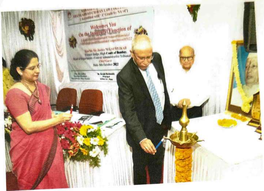
LIGHTNING OF LAMP BY THE CHIEF GUEST HON'BLE JUSTICE M.G. SEWLIKAR, FORMAR JUDGE HIGH COURT OF BOMBAY.