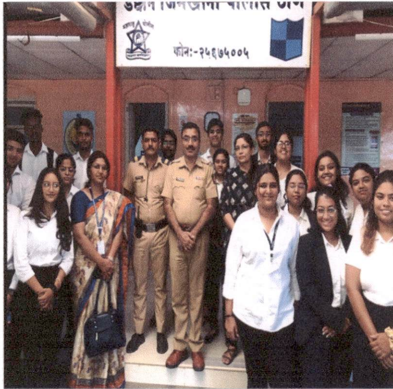
Visit to Deccan Police station