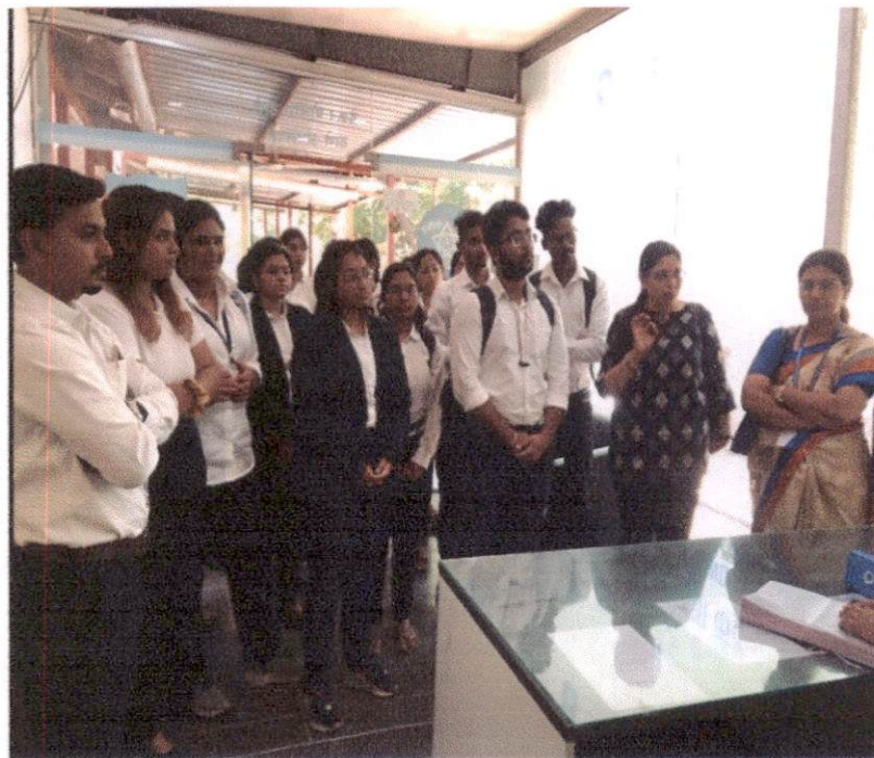
Visit to Deccan Police station