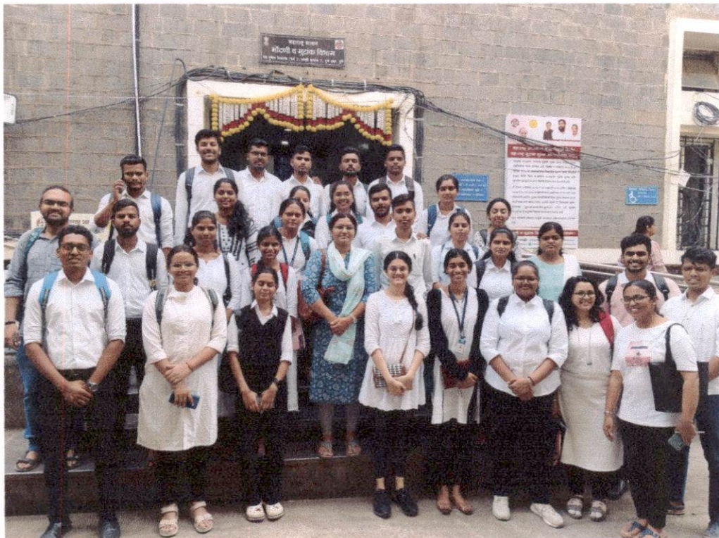
Visit to Registration Office, Pune