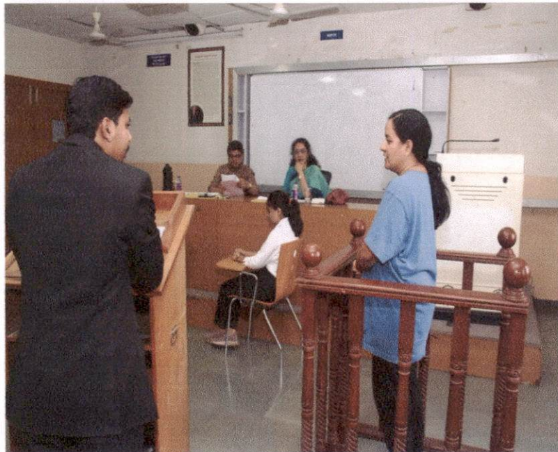
Mock Trial conducted for the certificate course on 'Crime Investigation and Trial'