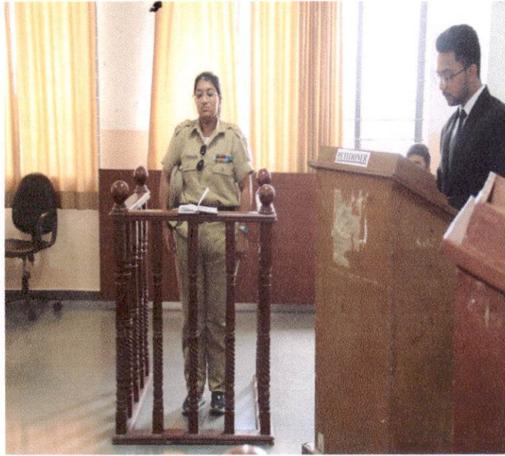
Mock Trial conducted for the certificate course on 'Crime Investigation and Trial'