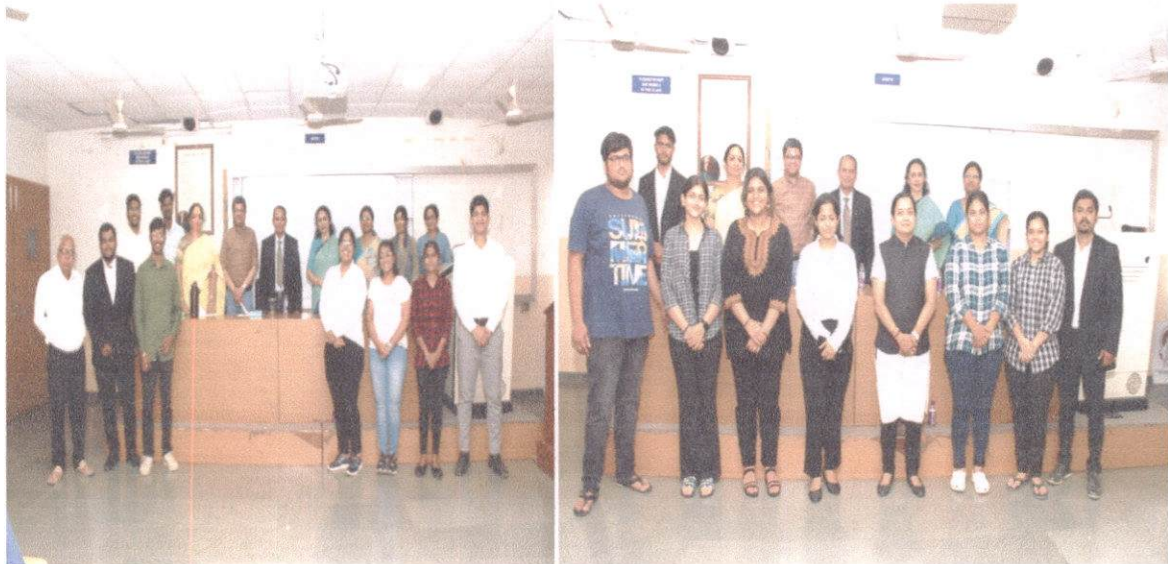
Students of Certificate course on 'Crime Investigation and Trial' with resource persons and faculties